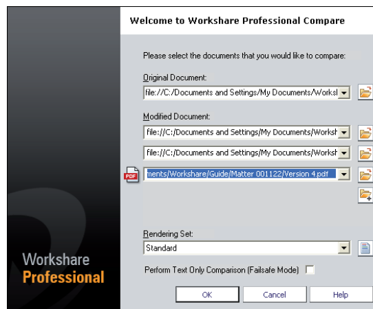
Figure 2: The 1 to Many Comparison feature in Workshare Professional 5 allows you to compare your master version with multiple versions in one single view.

Extend document management with security and version control when exchanging documents inside and outside the organization. Workshare Professional 5 integrates easily with Document Management System (DMS) security controls protecting documents wherever they move and always tracks the correct master document versions delivering a complete audit trail across the entire document lifecycle.